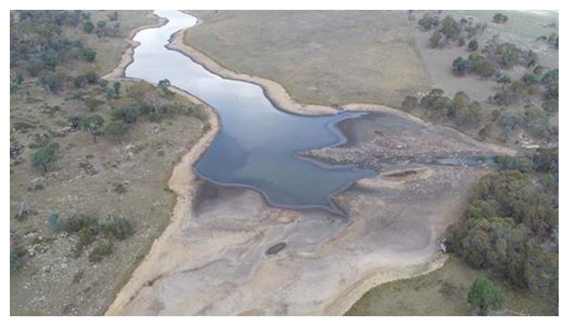
The Guyra water supply dam faces the real prospect of running dry by August

"We just don't know when this drought will break in our