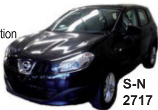
CALL IN & INSPECT 2013 NISSAN DUALIS ST 4x2