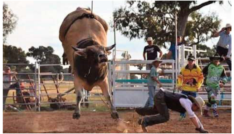
The Bull Ride will be Friday night's main event at the Guyra show.

Next Friday night at 7pm, the action will take place at centre ring at the Guyra show. Ace of Hearts, Super Cool, Six Barrel and locally sponsored "Multi Block" Argy Bargy will head line the night's main event.