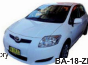
IDEAL FIRST CAR 2009 TOYOTA COROLLA ASCENT HATCH