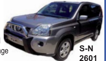
TEST DRIVE TODAY 2007 NISSAN X-TRAIL ST 4x4 AUTO

Our business is built on Trust, Honesty, Great prices & Quality Used Vehicles