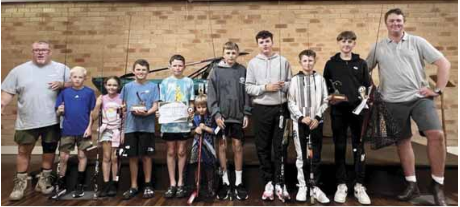
Junior and sub-junior entrants and winners at the Anglers Club Presentation Day

Guyra Anglers Club held their combined AGM, Presentation Day, and yearly BBQ lunch on March 8th. The AGM saw some committee changes, but overall the main group stayed.