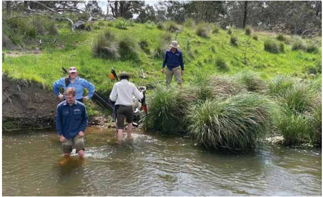
Northern Tablelands Local Land Services staff navigate a river while fencing Bell's Turtle nests.

capture some of the hatchlings we have previously released, which are growing and surviving well. Hatchlings have also previously been tracked using micro-radio transmitters, with some of the hatchlings travelling up to two kilometres in two weeks", he said.