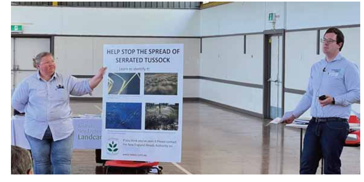
Local farmers and stakeholders gathered to hear from expert speakers,

The interactive panel discussion and stalls from local businesses added further depth to the day's focus on practical,