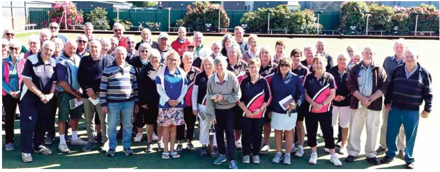
Veteran golfers were out in force last week with 133 nominations over three days

What a tremendous success! Our first attempt at this tournament and we had around 133 nominations over the three days which I think equals all expectations.