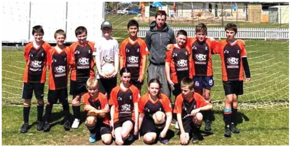
Guyra Under 12s received the David Martin memorial award is most outstanding team

A few special awards are handed out each year in recognition of hard work and dedication to the club. The David Martin memorial award is for