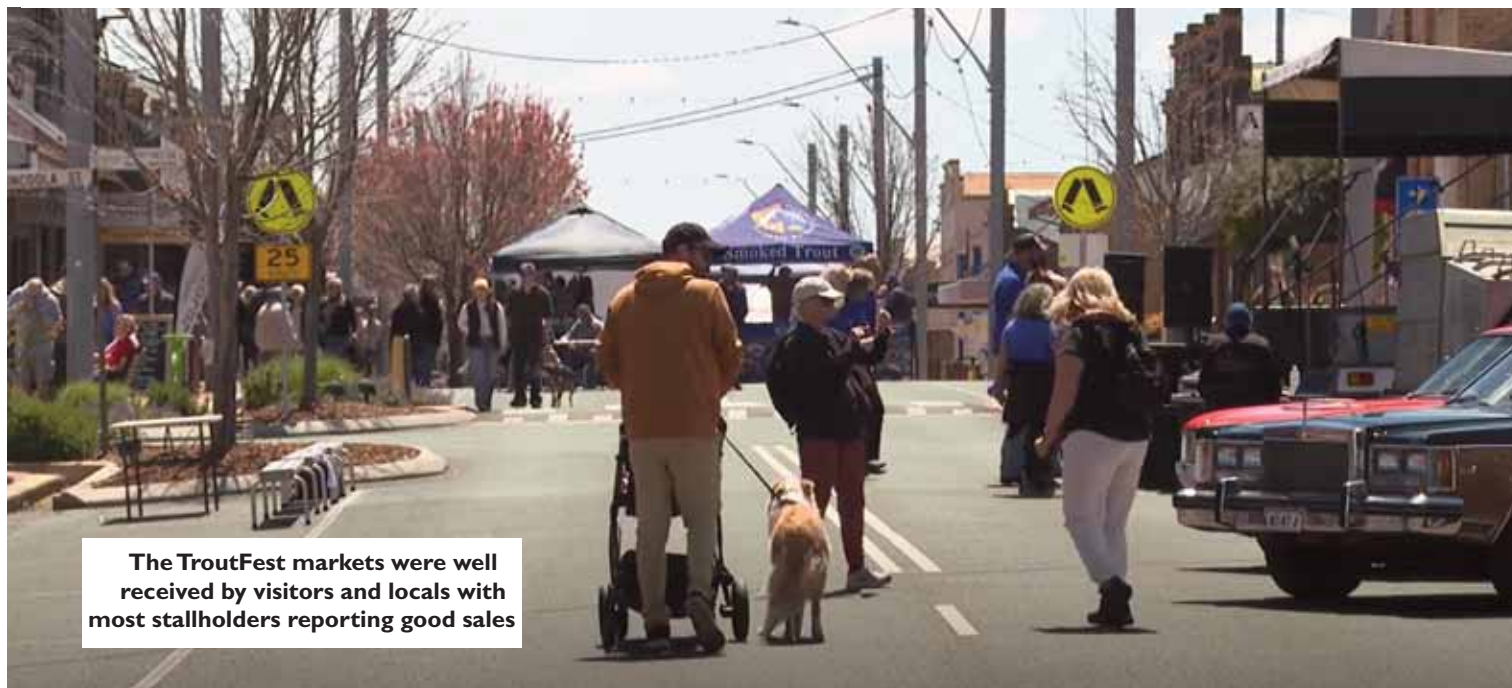
The TroutFest markets were well received by visitors and locals with most stallholders reporting good sales

The TroutFest held over the long weekend once again drew people to Guyra from far and wide. While they were in town there was plenty to keep them busy, from workshops to market stalls, open gardens, art displays and plenty of fish-