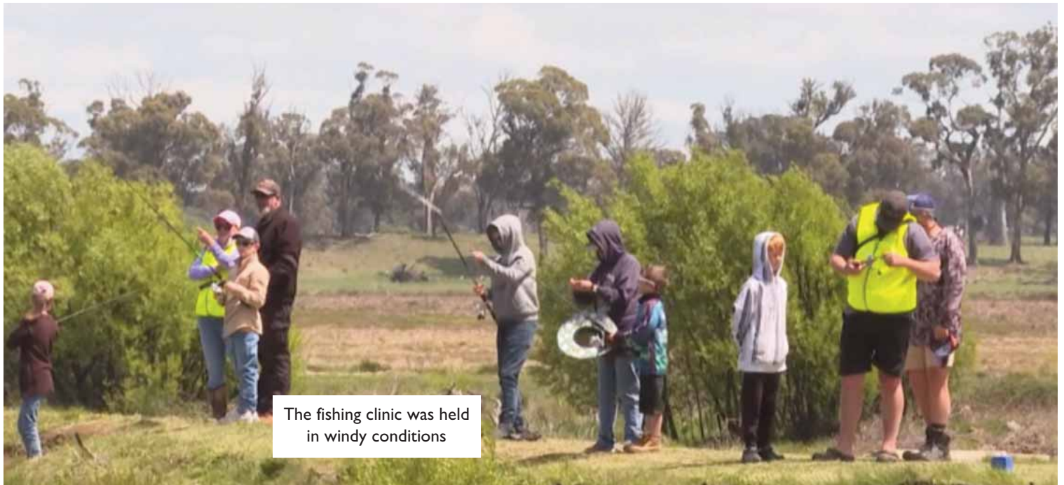
The fishing clinic was held in windy conditions