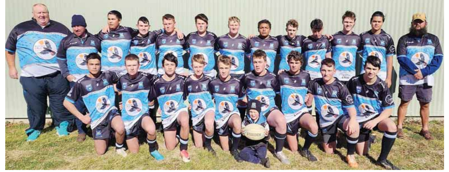
The Under 16's Junior League team wearing the Naidoc week jumpers

On the freezing cold day of Saturday, 6th July, Guyra hosted the Tingha Tigers. Only 3 games were played in the icy cold conditions, but all our Guyra players turned up and played some great footy.