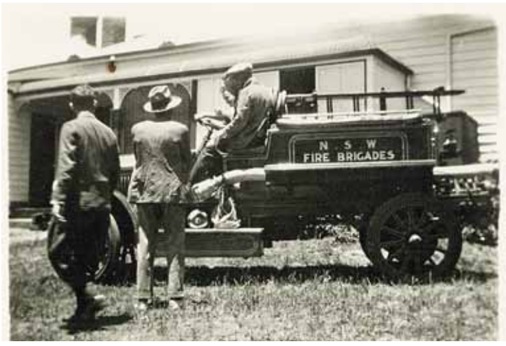
Above: The first Guyra Fire Brigade truck

"The cold was intense, freezing the water which remained in the long hose trailed in the street and rendering it impossible to coil. The clothing worn by the fireman also crackled with ice, and a nip of rum, served to each of them by the captain, prior to dispersal, was much appreciated."