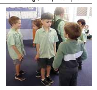
K-2 Dance Performance