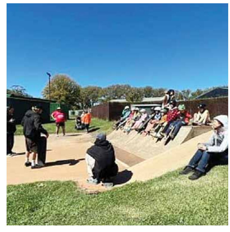
There were 30 registrations of local Guyra children and also amilies from Armidale to attend our first, free Totam Skateboarding workshops and BBQs held in 2023