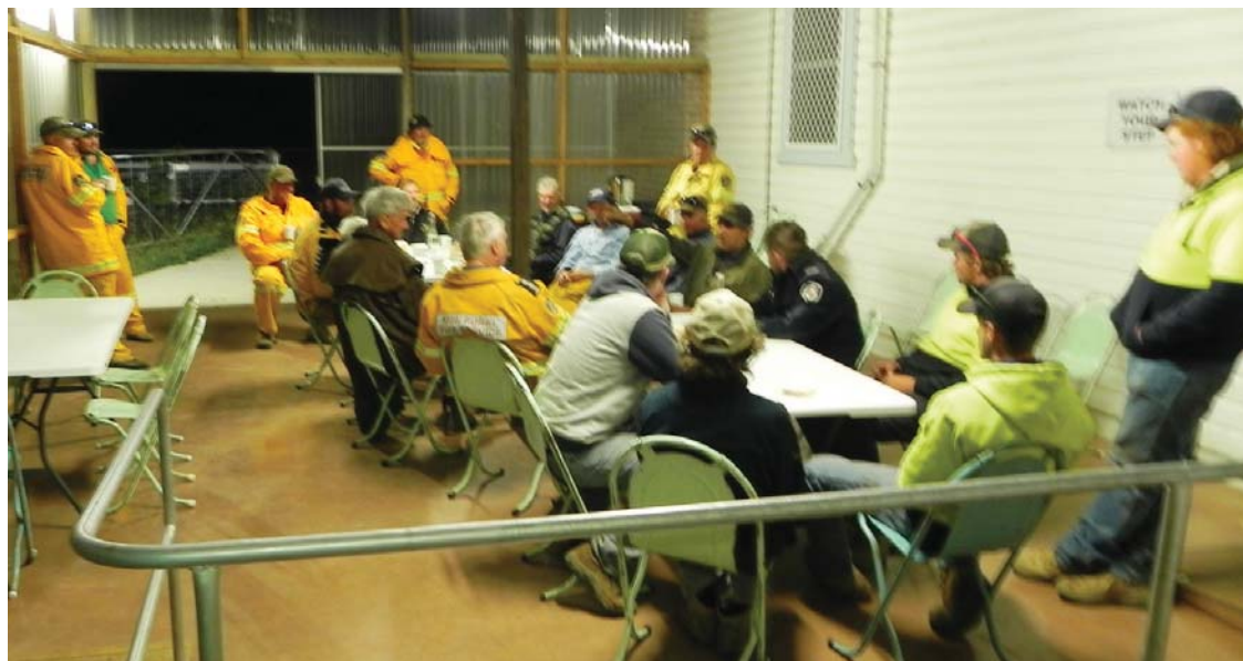
Food prepared for the postponed performance was repurposed at a 'Pop Up Firies Pit Stop' as Ben Lomond was on alert to evacuate