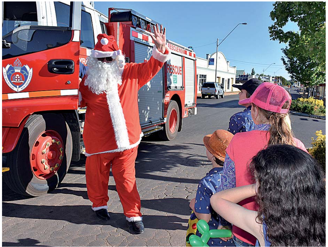
Santa will be one of the attractions at the Christmas Party being held in Bradley Street on December 6th

About 30 Christmas market stalls will be operating and you can try to win a ham for Christmas by buying a ticket and watch the wheel spin. Guyra's Christmas tree will be located near the National Australia Bank. The high point of the festivities will be the lighting of the tree and the ar-